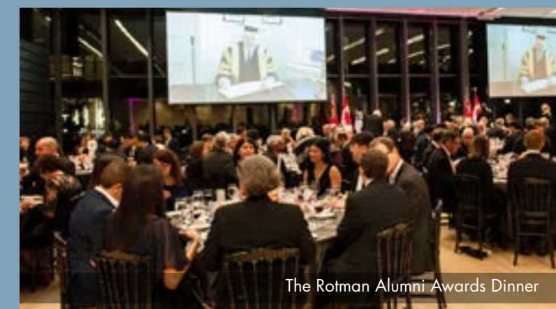
The Rotman Alumni Awards Dinner