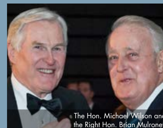
The Hon. Michael Wilson and the Right Hon. Brian Mulroney